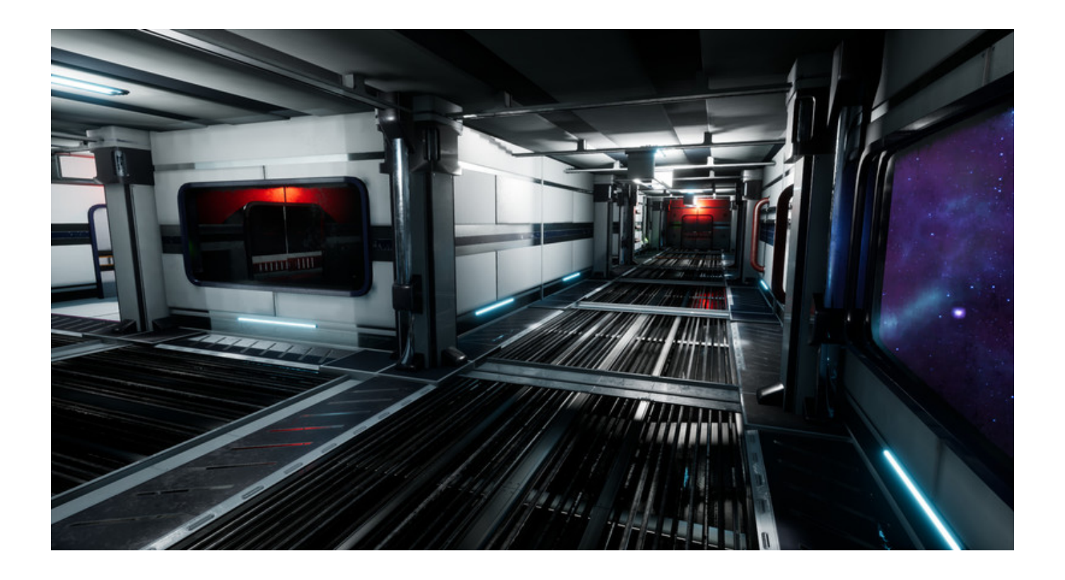
Heroes Of A Broken Land 2 Activation Code [Patch]

Download ->->-> <a href="http://bit.ly/2SQV5Cz">http://bit.ly/2SQV5Cz</a>